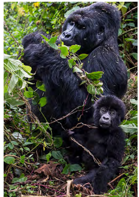
A mother and baby gorilla in the Democratic Republic of Congo's Virunga National Park, a protected World Heritage Site and most biodiverse park in Africa.

The International Energy Agency (IEA) has stated that in order to limit global warming to within the threshold of 1.5 C, no further fossil fuel expansion must take place. However, the Production Gap Report 2023 has found that governments plan to produce around 110% more fossil fuels in 2030 than would be consistent with limiting warming to 1.5°C. 2 In a similar vein, the newly launched UNFCCC NDC Synthesis Report 2023 shows that national climate action plans remain insufficient to limit global temperature rise to 1.5 degrees Celsius and meet the goals of the Paris Agreement. 3 An early look at the findings from the first-ever global stocktake indicates that the world is not on track to achieve the goals of the Paris Agreement. As UN member states negotiate their response to the stocktake's findings, it is important to underscore the critical need for a moratorium on the expansion of fossil fuel and other industrial activities in primary and priority forests in these regions and globally in order to create space for financial solutions (like debt relief, subsidy redirection, payments for ecosystem services, and other financial system innovations) to be established to preserve these global treasures, meet development needs and secure climate stability.