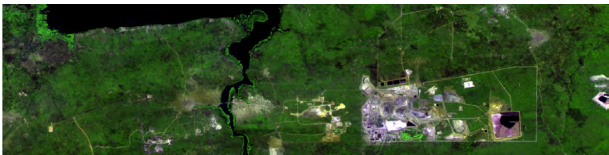
Mutanda Mine in the Democratic Republic of Congo in CBERS4 PAN10 image. It is the largest cobalt mine in the world. Located in the Katanga Province of the Democratic Republic of Congo, near Kolwezi.