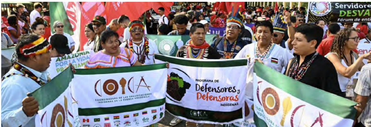
Indigenous people from Amazon countries and members of social movements take part in the March of the Peoples of the Earth for the Amazon in Belém, Para State, Brazil, on August 8, 2023 for the two-day meeting of the Amazon Cooperation Treaty Organization (ACTO).